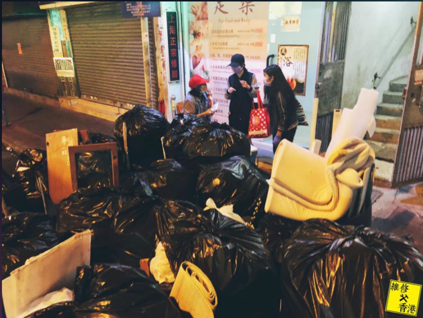
Handing out masks to cleaning workers in Tokwawan