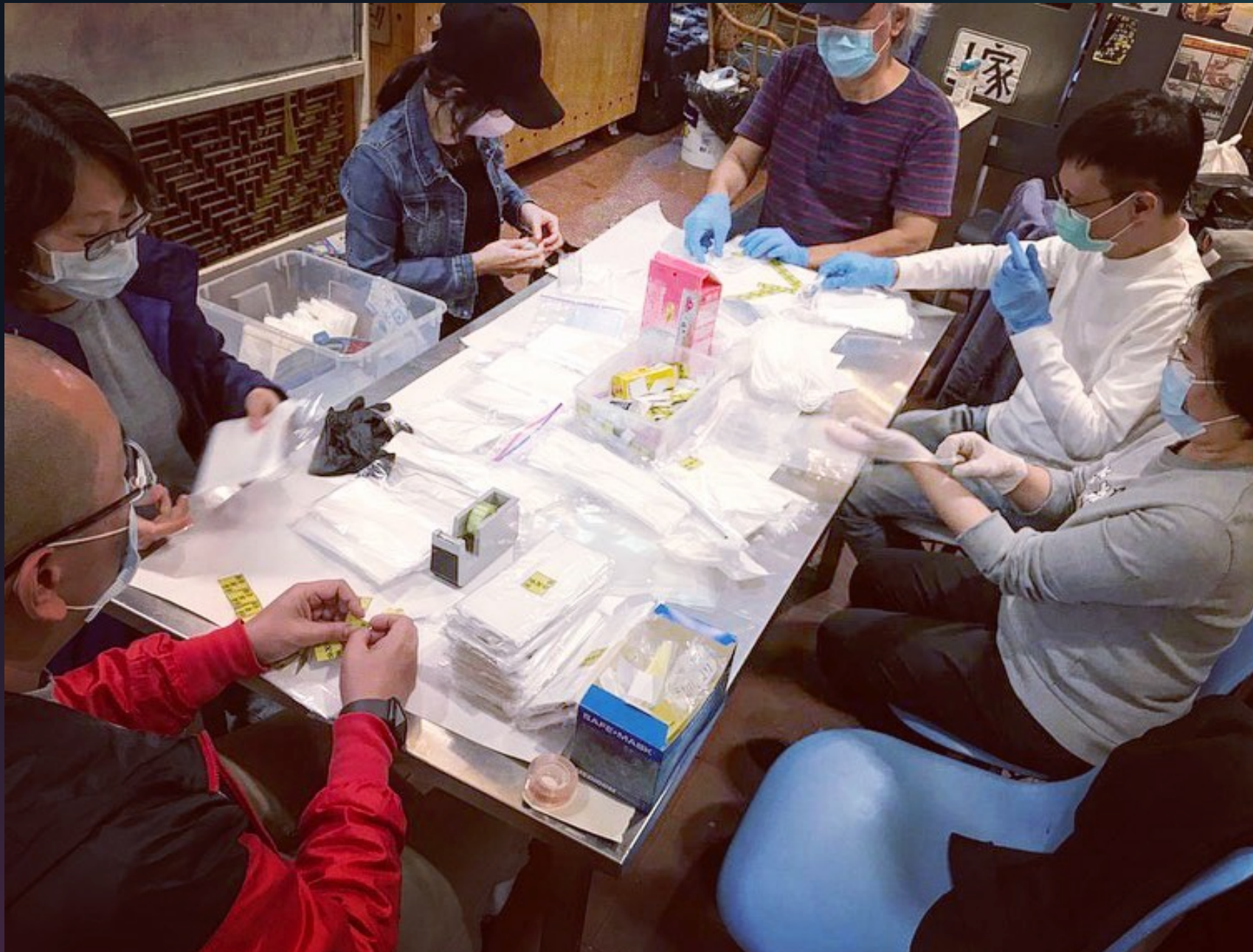
Repacking masks and adding pro-democracy and Covid-19 prevention messages