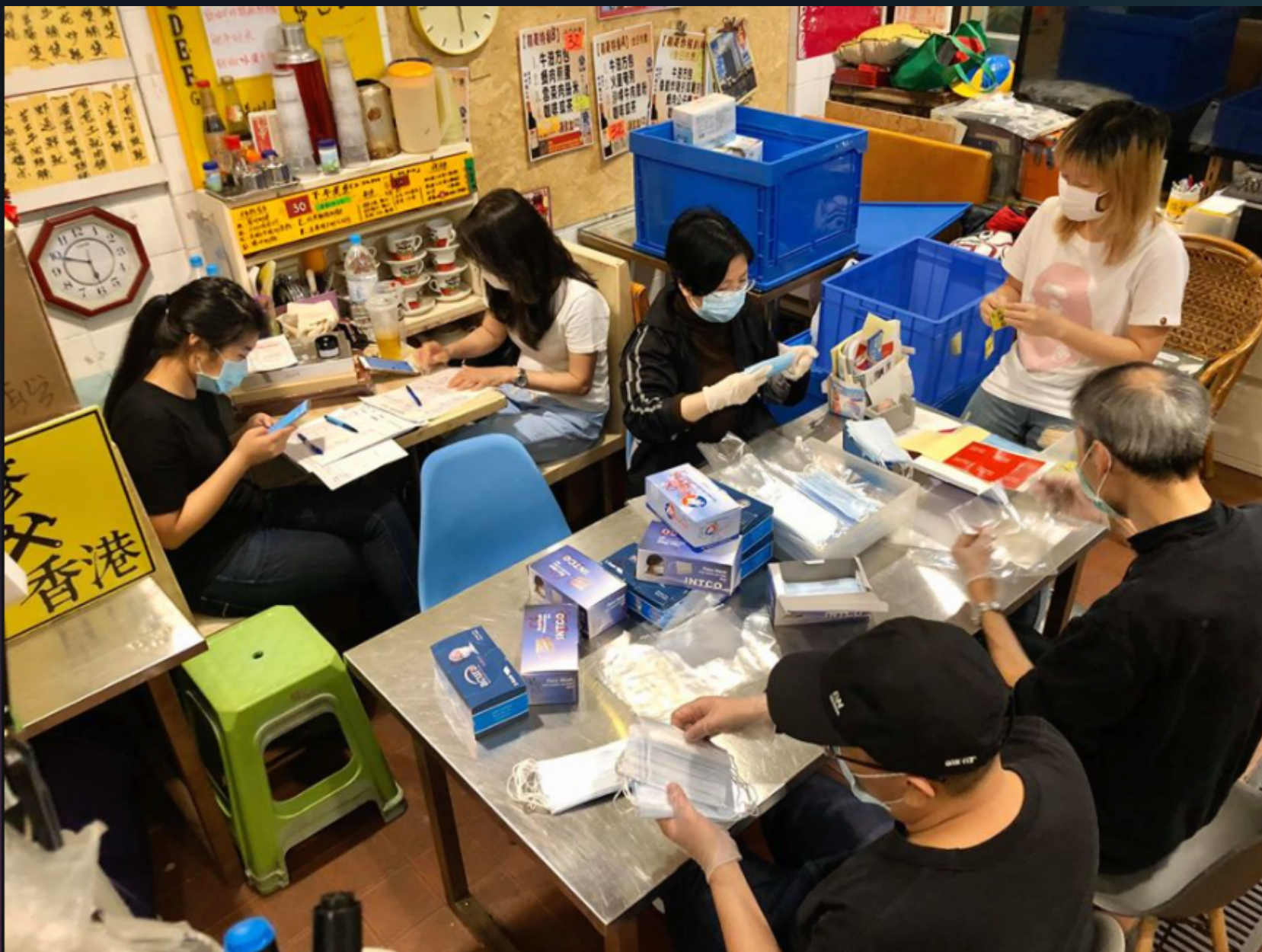
Repacking masks and adding pro-democracy and Covid-19 prevention messages