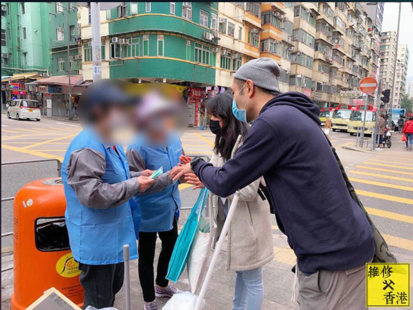
Handing out masks to cleaning workers in Tokwawan