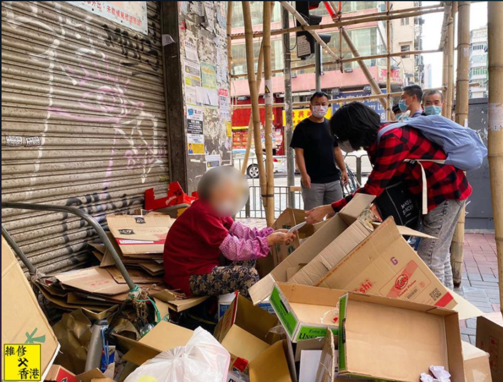
Street recyclers were another group that we focused on